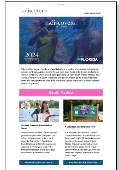
Example of Undiscovered Florida E-newsletter